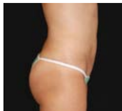
After 2 months