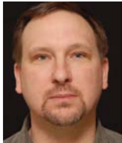
After 6 weeks