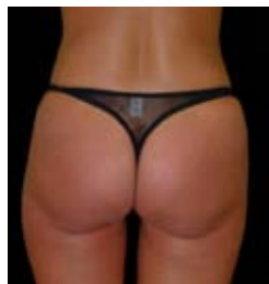
After 3 months