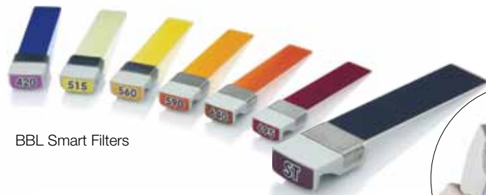
BBL Smart Filters

SkinTyte™ utilizes infrared energy to deeply heat dermal collagen while protecting the entire treated area with sapphire contact cooling. This process promotes contraction of the collagen, initiating the body's natural healing process. Following treatment, a new foundation of collagen is created leading to increased skin firmness.